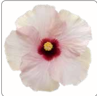
ADONICUS PEARL ®