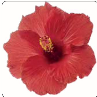
JUNO RED ®