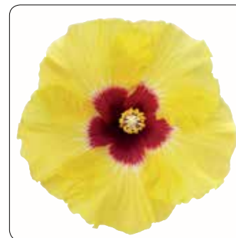
BOREAS YELLOW ®