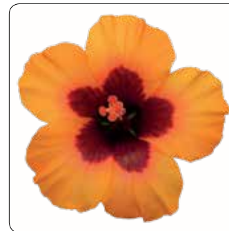
PETIT SUNRISE ®