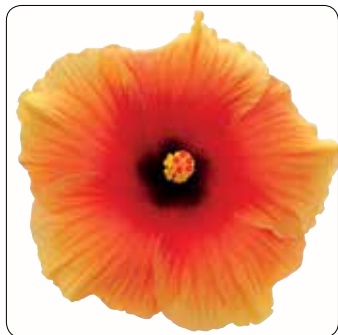
NEW APOLLO ®