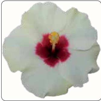
ADONICUS WHITE ®