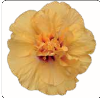
ADONICUS DB. YELLOW ®