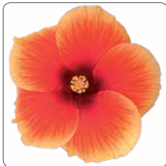
APOLLO BIG ®