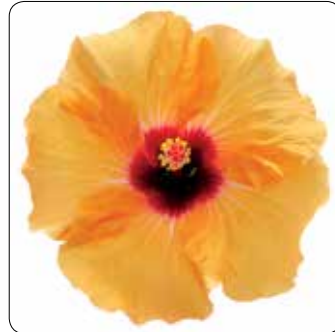
ADONICUS APRICOT ®