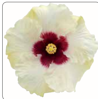
BOREAS WHITE ®