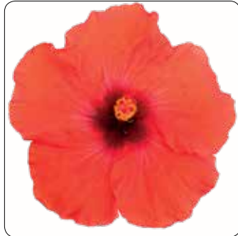
ADONICUS ORANGE ®