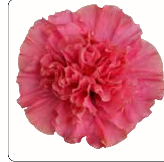
ADONICUS DB. PINK ®