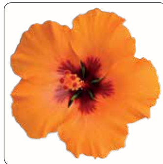
PETIT ORANGE ®