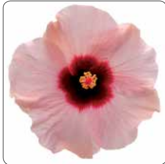
ADONICUS ROSA ®