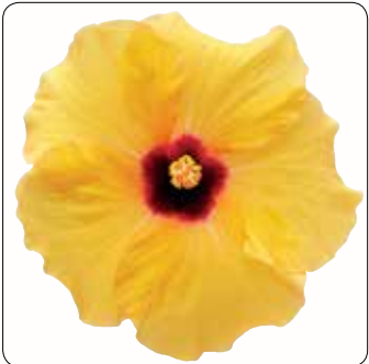
ADONICUS YELLOW ®