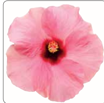
ADONICUS PINK ®