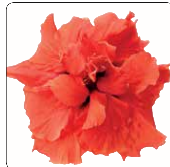
ADONICUS DB. ORANGE ®