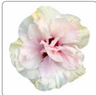
ADONICUS DB. PEARL ®