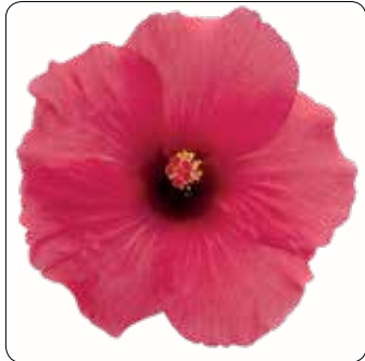
ADONICUS DARK ®